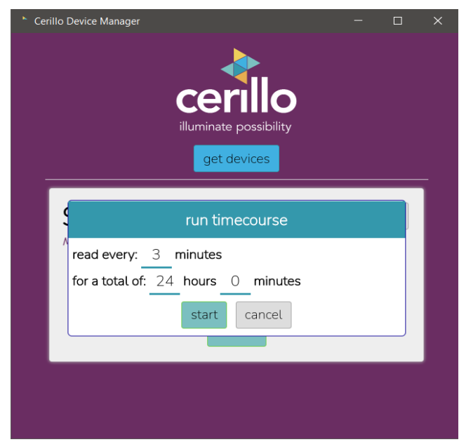
Figure 1. Time Course Setup makes it easy for the user to customize measurment intervals.

Due to the Stratus microplate reader's small size and versatility, it was placed inside of a shaking incubator at 37°C and 180 rpm. Data was collected for 24 hours with no further user input