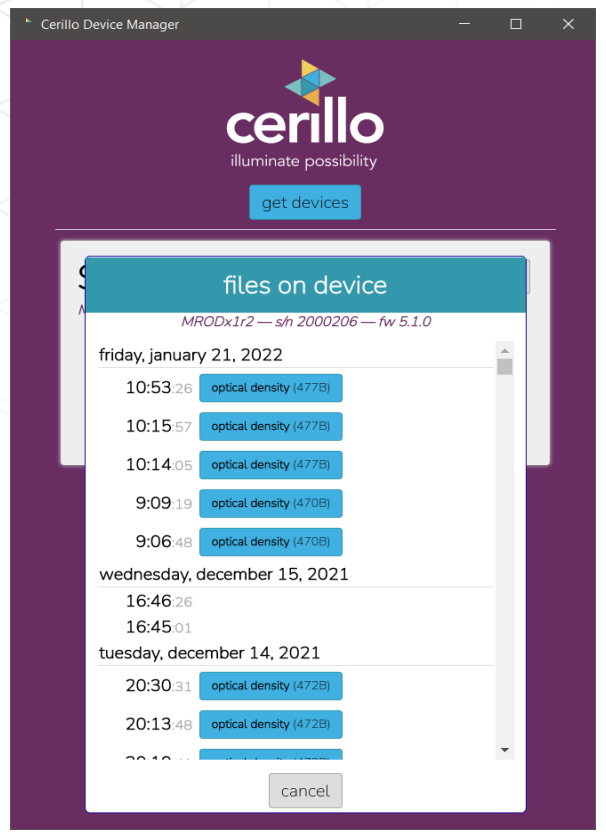
Figure 2. File Storage is easily accessed via the Cerillo Device Manager which allows data to be exported and saved for analysis.

Furthermore, traditional plate readers have been shown to have poor temperature regulation which causes high variability and less accuracy [4]. The use of the Stratus inside of a shaking incubator allows for the stability of environmental conditions leading to higher quality data collection.