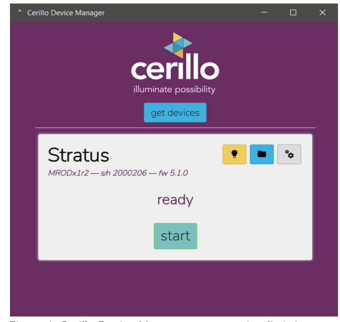
Figure 1. Cerillo Device Manager creates a simplistic interface to manage the Stratus microplate reader.

After incubation, the plate was measured using Cerillo's microplate reader, the Stratus, at a wavelength of 600nm. The Stratus was controlled by the Cerillo Device Manager software (Figure 1). This software allows for easy data analysis by exporting data directly to a universal format that is compatible with all analysis software packages. To read a single plate, "quick read" is selected on the device menu (Figure 1). The data is then stored under "files" and can be saved to the user's location of choice (Figure 2).