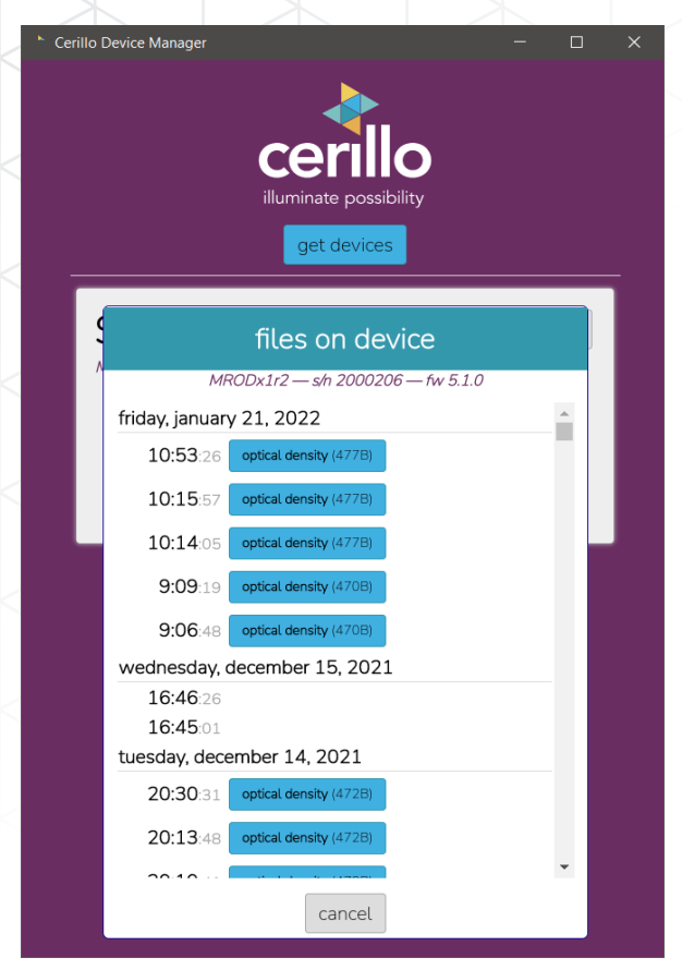
Figure 2. File Storage is easily accessed via the Cerillo Device Manager which allows data to be exported and saved for analysis.

The Bradford assay standard curves were analyzed for quality using a 4-parameter logistic-fit curve. The plotted results show the expected relationship between BSA and BGG (Figure 3). There is low variability between sample replicates and a good curve fit. The ratio between BSA and BGG concentrations is representative of the known offset of 0.56 determined by ThermoScientific<sup>TM</sup>. This indicates that the Stratus produces accurate and highly precise measurements for total protein concentration. A comparison with data from other spectrophotometers on the market revealed equivalent results, confirming the performance of the Stratus is comparable to other absorbance-based microplate readers.