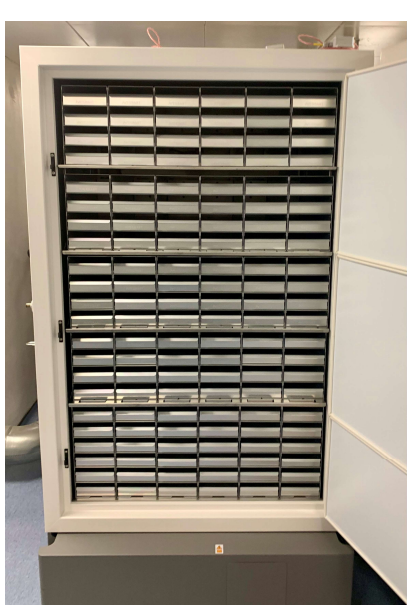
Figure 2. The F740hi filled with aluminium, front opening racking.