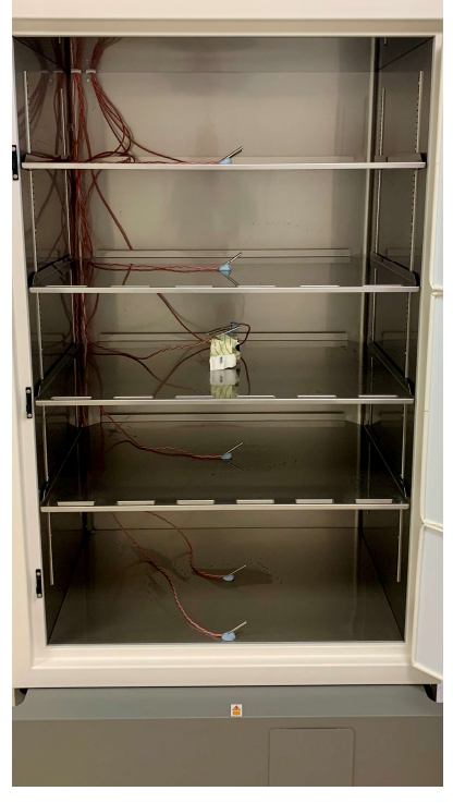
Figure 1. The F740hi with probes positioned at the centre of each shelf. Furthermore, additional probes were positioned at the back of the top compartment (compartment 1) and the front of the bottom compartment (compartment 5). Compartment 3, the middle compartment, had its probes positioned to be exactly at the middle point of the cabinet.

Ultra-Low Temperature (ULT) freezers are well known to be high consumers of energy. Holding set temperatures 90°C to 100°C colder than their environment will always require a significant amount of energy. One way to reduce ULT freezer energy consumption is to warm up the set temperature. By doing so energy consumption will be reduced from 18-34% depending on the model, age & condition of the freezer. When considering warming up their ULT freezers, some end users raise concerns that by taking such an action they may expose their samples/contents to unfavorable temperatures during their day to day operation.