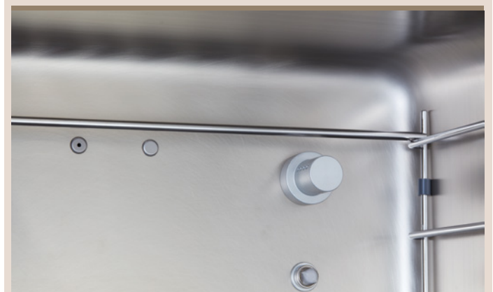
Figure 2: Eppendorf easy-to-clean incubator chamber. Deep-drawn chamber with rounded corners and smooth, seamless surface prevents contamination formation in hidden corners and allows quick and easy cleaning procedures.