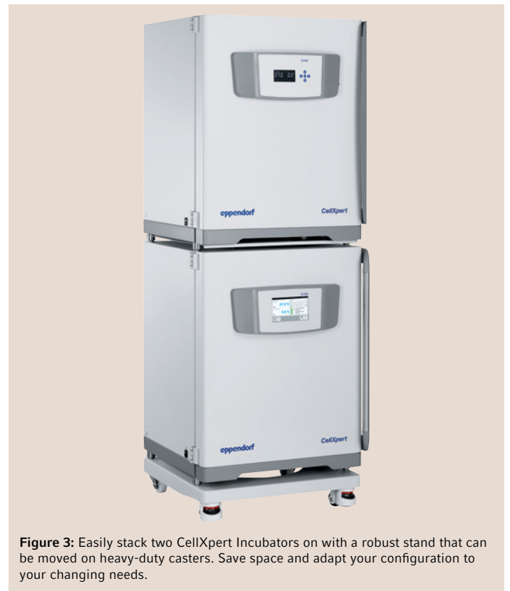
Figure 3: Easily stack two CellXpert Incubators on with a robust stand that can be moved on heavy-duty casters. Save space and adapt your configuration to your changing needs.

The Eppendorf solution: Eppendorf offers a robust stacking stand (Figure 3). The lower base includes heavy duty casters, and can be ordered separately, for use with a single incubator.