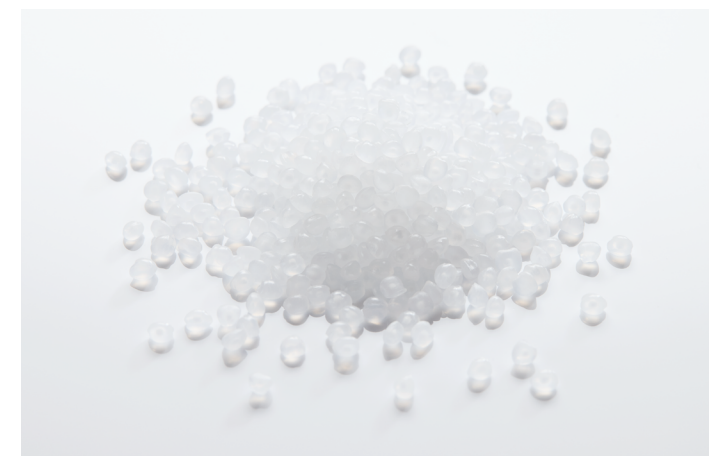
Figure 1: Polypropylene granulate

One of the most promising resources is used every day in the kitchens of restaurants, canteens or even at your home – used cooking oil (UCO). UCO is a mixture of triglycerides and free fatty acids and is, therefore, a good source of raw materials for many products, mostly used today to synthesize biodiesel, aviation fuel or lubricants, but it is also a useful source for other chemicals and products.