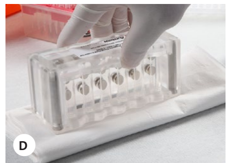
Figure 4. Separation of magnetic beads in tube format