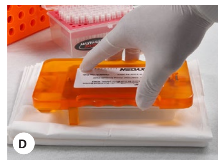
Figure 2. Separation of magnetic beads in microplate format