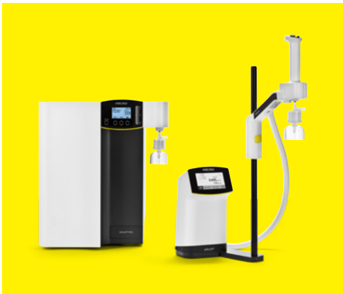
Supply ultrapure water from Arium® Pro and Arium® Comfort

The stepless height adjustment from 8.5 – 65 cm allows you to fill different sized containers. Thanks to its angular designed stand even bulky vessels can be optimally positioned under the dispense outlet. Depending on your needs you can adjust the volume dispense from 50 mL up to 50 Liter.