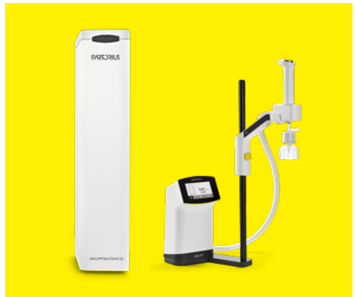
Supply pure water from Arium® Bagtank