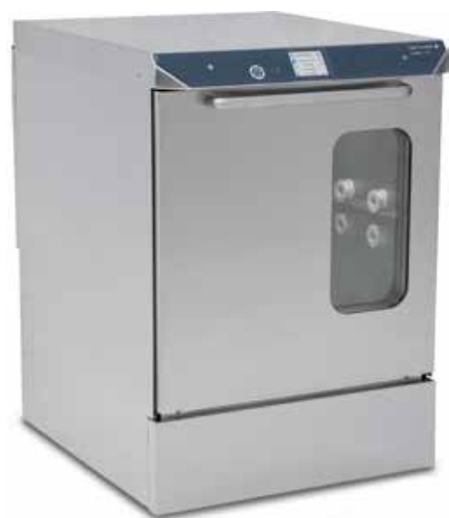
Lancer model 810 LX undercounter labware washer; shown with optional View-In-Process (VIP) window.