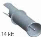
Adapt 14 kit