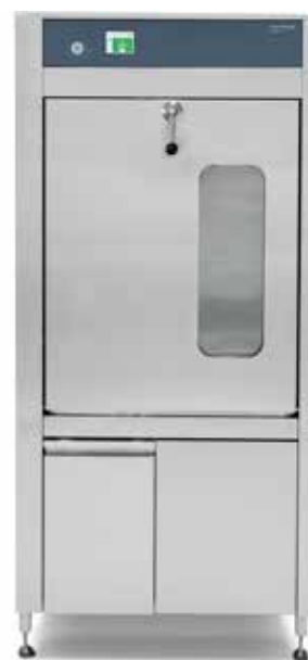
Getinge Lancer model 1400 LX labware washer; shown with optional View-In-Process (VIP) window.