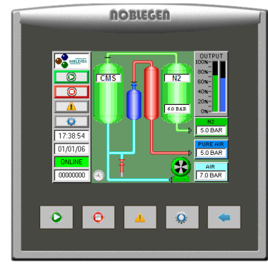
Colour HMI Touch Screen