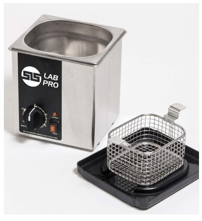
Specifications are subject to change for continual improvements

The SLS2006 provides the cost benefits of excellent entry level ultrasonics plus renowned quality and reliability.