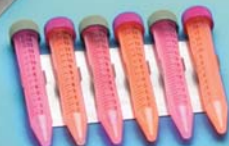
Fig. 3, 6