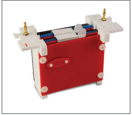
The omniPAGE Mini blotting insert is available in traditional wire electrode format or with rapid high-intensity plate electrodes to transfer up to 4 and 2 gels respectively