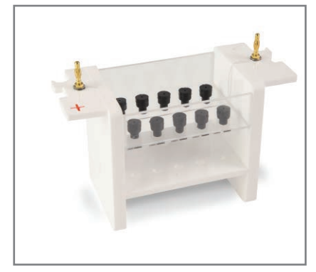
The omniPAGE Mini capillary tube gel insert may be used for IEF of up to 10 capillary tube gels in as little as 3.5 hours