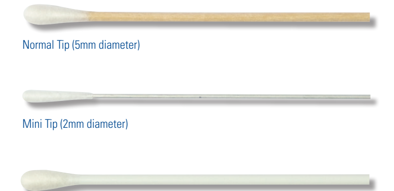
Normal Tip (5mm diameter)

A fully synthetic material with high absorbency. Ideal for hygiene testing with most commercial luminometer techniques.