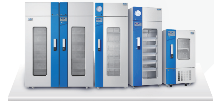
HXC-1369 HXC-629 HXC-429 HXC-149

Refrigeration system is designed with an inverter compressor and dual-speed fans, providing an optimal temperature performance of 4 +/- 1°C inside the cabinet to safeguard stored products.