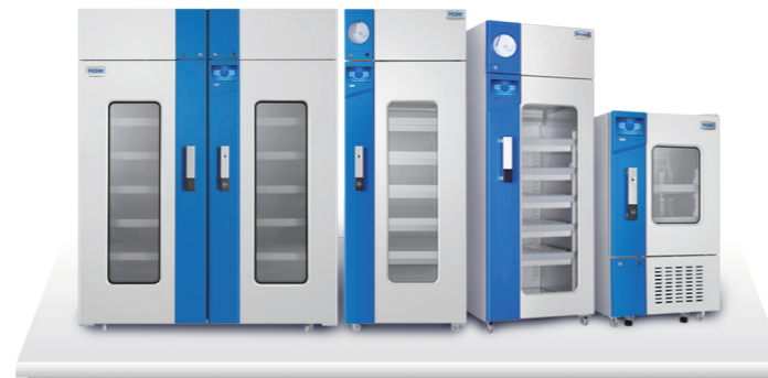
HXC-1369T HXC-629T HXC-429T HXC-149T

Real-time control and monitoring of blood information in the cabinet is possible via built-in smart blood management APP and cloud network connection. Blood product information and temperature are available in large LCD display.