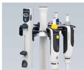
The rack mount also fits the Transferpette® S bench-top rack.