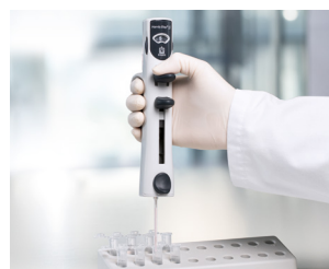
Dispensing small volumes