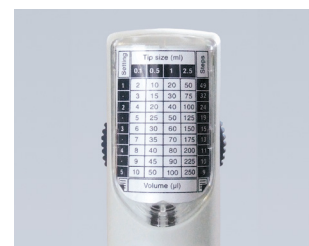
Fast volume selection with the volume table on the back side