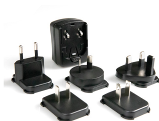
Universal AC adapter Adapter for Europe, UK, USA, Japan, Australia, New Zealand