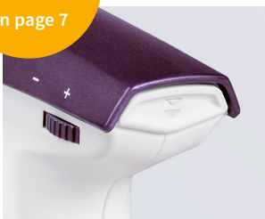
Gravity delivery or blow-out with motor power