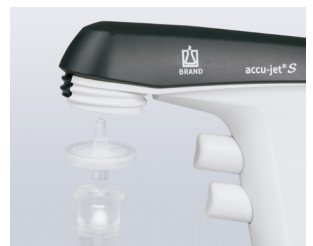
Membrane filter and check valve prevent liquid penetration