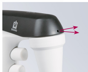
Direct outlet of sample vapors