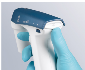
Efficient single-handed operation