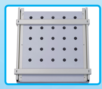
Designed allow maximum air flow