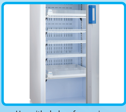
Use with shelves for maximum flexibility