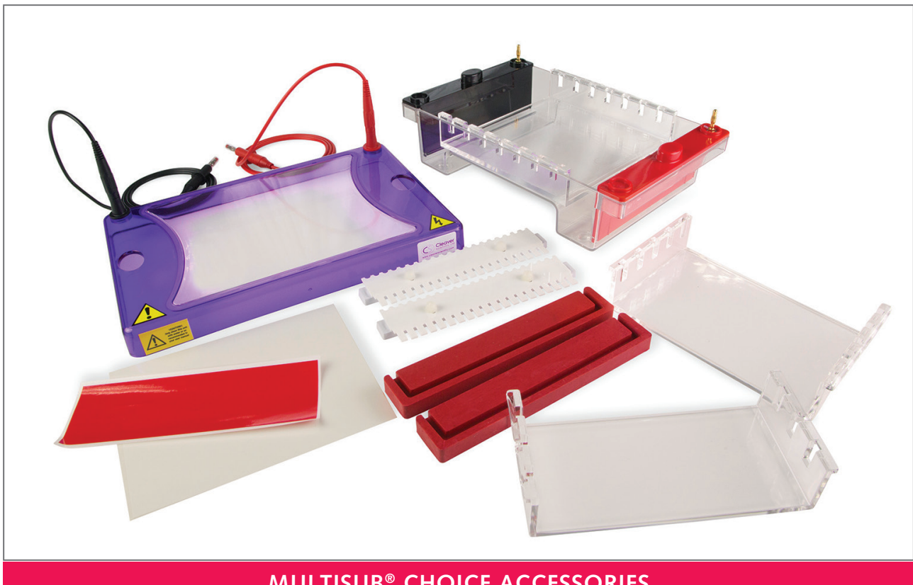
multiSUB<sup>®</sup> Choice stretch version