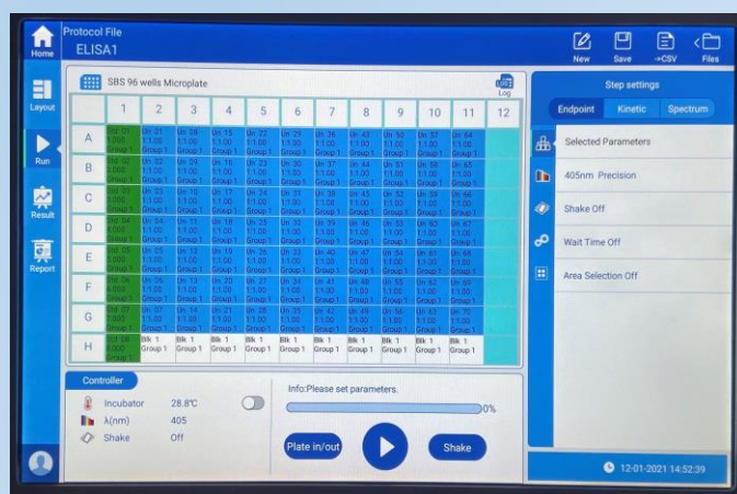
96-well Plate Layout Screen