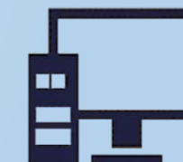
PC Software Available