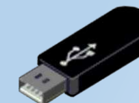
Data Transfer via USB