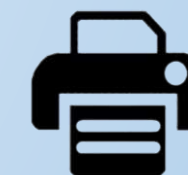
Thermal Printer Available