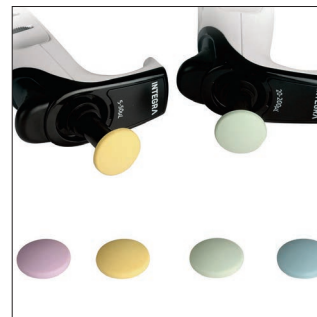
Plunger caps Color coded