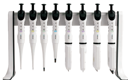
Linear stand (3215)

Storing pipettes upright is important to prevent liquid or debris from entering the tip fitting. Proper storage also extends the life of a pipette. The INTEGRA linear stand is ideal for hanging EVOLVE pipettes up off the lab bench. Up to twelve manual pipettes can be placed on a linear stand. EVOLVE shelf hooks are also available for proper storage.