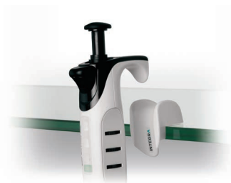
Shelf hook (3211)