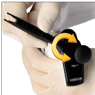
Multipurpose tool (3200) for calibration, O-ring removal and plunger spring exchange