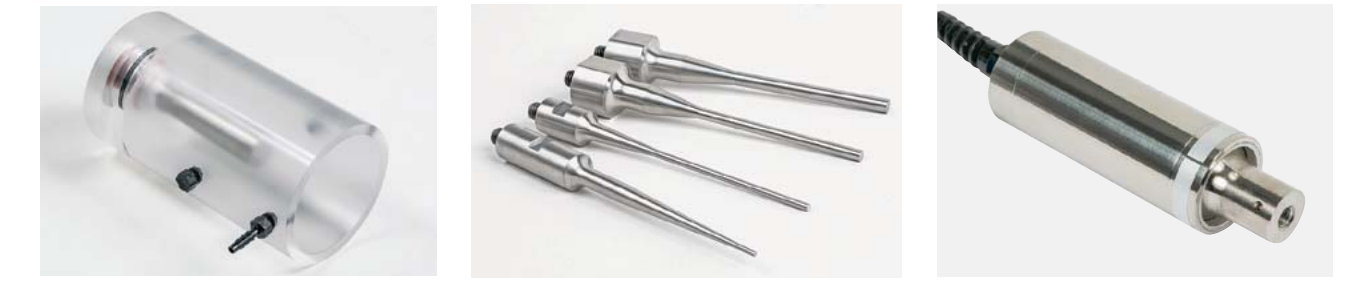
Cup Horn: This specialized horn permits high-intensity sound to be applied to multiple samples without direct horn contact. 3.0" diameter only.

The Sonifier SFX Series can be equipped with a wide range of specialized tools and accessories to meet specific application requirements.