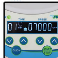
Digital display and control