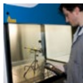
AIR FLOW SPEED TEST

Each Faster cabinet is tested conforming to EN - 12469:2000, EN - 61010:2001 and released with FAT certificate of the tests performed.