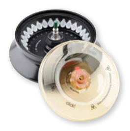
MicroClick 30 x 2 Rotor