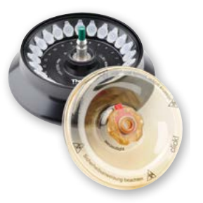
MicroClick 24 x 2 Rotor