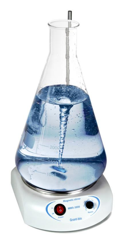
Magnetic Stirrer MMS-3000