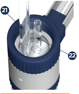
Figure 6 Valve block, bottom view

The reflux tube \boldsymbol{2} is already attached to the bigger hole.