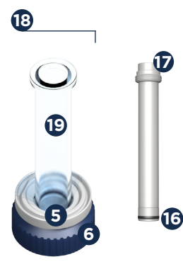
Figure 4 Aspiration system, located under outer housing