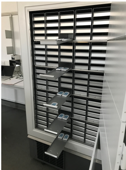
Figure 1. ULT freezer fully racked with temperature loggers in place. Testing The Impact Of Racking

Ultra Low Temperature (ULT) freezers are a predominantly used in life sciences for the long term storage of valuable samples and products. The use of racking can vary with some ULT freezers being completely racked (figure 1) whilst others are devoid of any racking whatsoever. Racking can be made of aluminium or stainless steel. This study set out to identify what impact of aluminium racking upon the temperature and energy performance of a ULT freezer at the -80^{\circ}\text{C} set point.