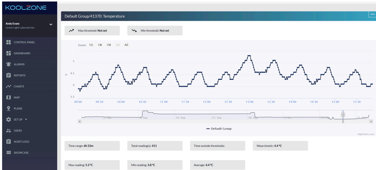
Figure 7. Biocold door opening data from the sample probe. Door openings occurred at 9.37am and 12.31pm.

Door opening data indicated that when looking at the compartment air temperatures the Liebherr unit had the fastest recovery times. It was also noted that the recorded temperature rises were the smallest in the Liebherr unit (under 1C following a 60 second door opening). The Lec unit took approximately twice the time to recover its compartment temperatures compared to the Liebherr unit with the Biocold taking over 4 times longer to recover its compartment temperatures. Furthermore it must be noted that the Biocold was also recovering to warmer temperatures compared to those in the Lec and Liebherr models.