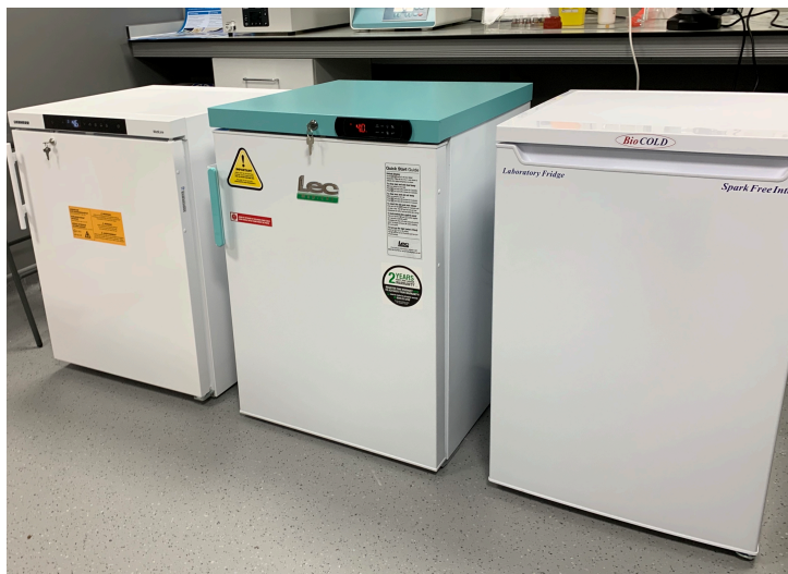
Figure 1. The three units being tested, from left to right, Liebherr, Lec and Biocold.

Fridges are widespread throughout scientific research and teaching. They are found in molecular sciences, life sciences, chemistry and stores departments throughout the UK. With UK labs aiming to minimize their running costs, highlighting the fridge with the lowest running costs is a useful exercise. However, energy consumption values alone would not be serving end user requirements. This study aimed to highlight some of the data and criteria which should be considered when selecting the most sustainable solution based on the specific needs of the researcher, their laboratory and the materials they are storing.