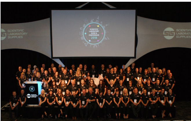
SLS staff at the 2018 Scientific Laboratory Show & Conference