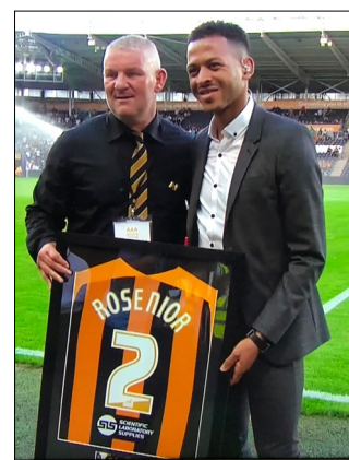
R: SLS shirt sponsor for Hull City