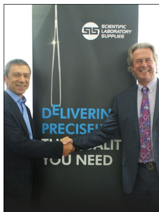
L: SLS join the Dutscher group