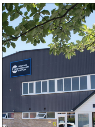
L: SLS Nottingham

Want to know more? View our timeline here. Find out more about SLS by watching this short video.