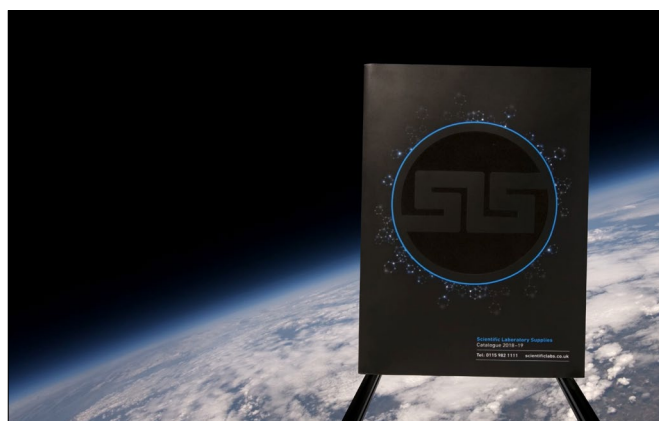
SLS catalogue launched into space, 2018