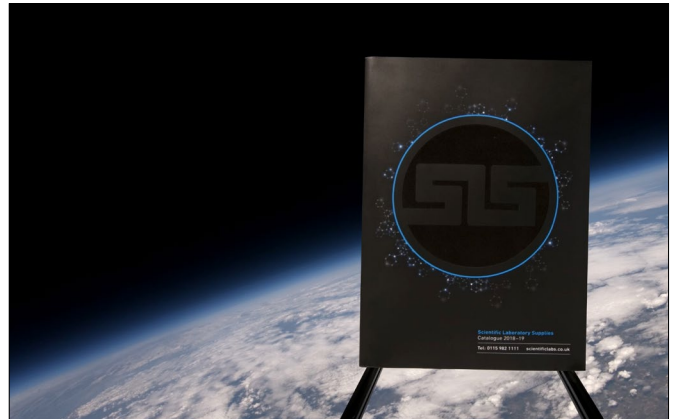
SLS catalogue launched into space, 2018