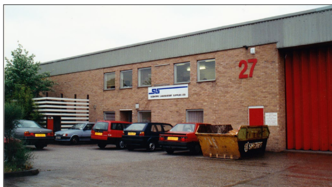
Scientific Laboratory Supplies original headquarters in Nottingham

In 2016 we acquired Analab and joined the Dutscher group, as well as launching another new catalogue and website to keep up with an ever-changing market. The SLS family at this point has grown to 170 employees. We even found some time to send catalogues into space!