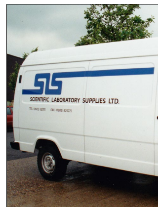
L: SLS' first catalogue, 1994. R: Original SLS van livery, 1995

decade, we launched our first website and in 2008 we held the first Scientific Laboratory Show & Conference , which has now grown to welcome over 1200 attendees from the scientific community in Nottingham, with the next show scheduled for May 16-18 th 2022.