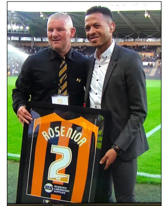
L: SLS Nottingham R: SLS shirt sponsor for Hull City