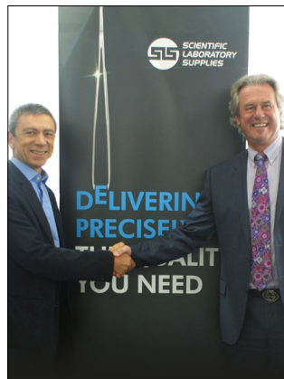
L: SLS join the Dutscher group R: SLS supply covid-19 vaccine storage