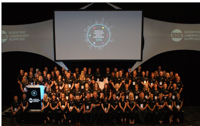
SLS staff at the 2018 Scientific Laboratory Show & Conference