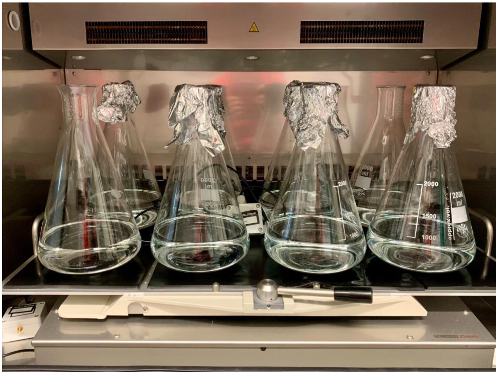
Figure 3. The Kuhner unit filled with 8 Erlenmeyer flasks.