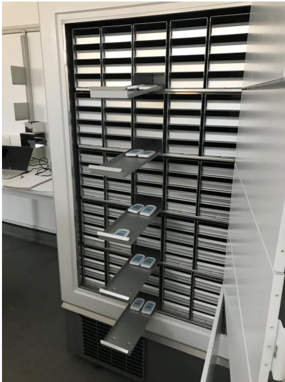
Figure 1. ULT freezer fully racked with temperature loggers in place. Testing The Impact Of Racking

Ultra Low Temperature (ULT) freezers are a predominantly used in life sciences for the long term storage of valuable samples and products. The use of racking can vary with some ULT freezers being completely racked (figure 1) whilst others are devoid of any racking whatsoever. Racking can be made of aluminium or stainless steel. This study set out to identify what impact of aluminium racking upon the temperature and energy performance of a ULT freezer at the -80^{\circ}\text{C} set point.