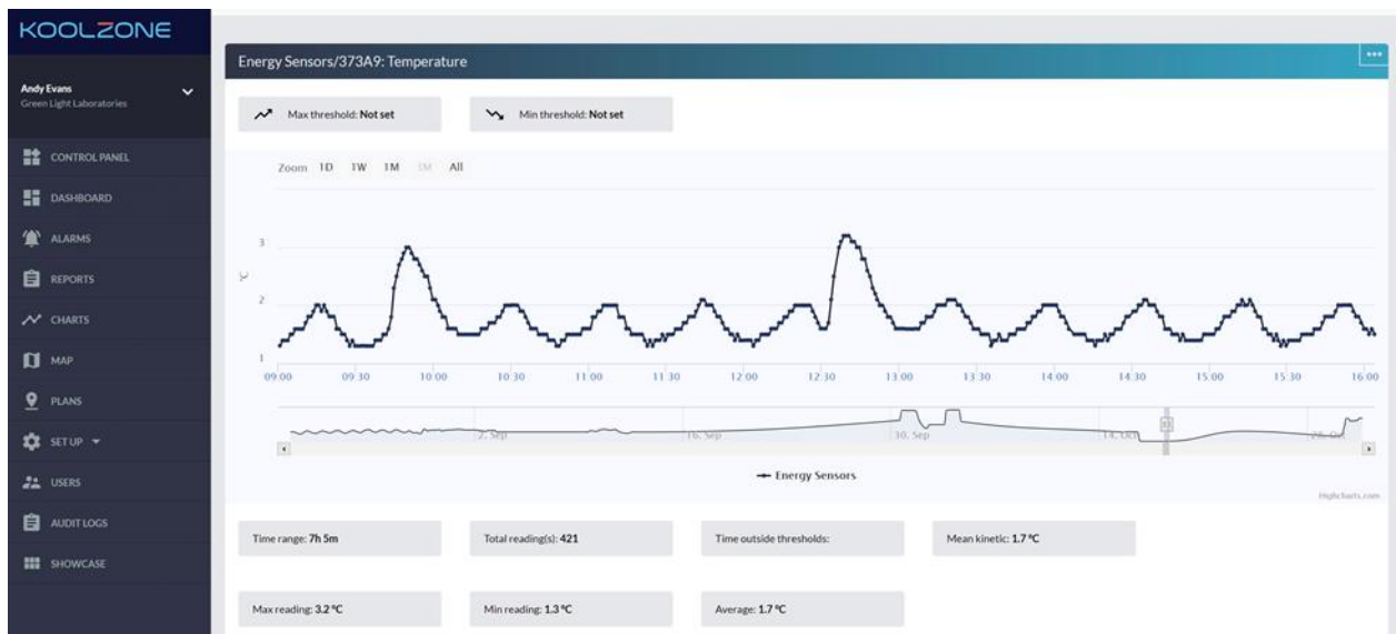
Figure 6. Lec door opening data from the sample probe. Door openings occurred at 9.39am and 12.28pm.