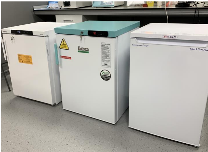
Figure 1. The three units being tested, from left to right, Liebherr, Lec and Biocold.

Fridges are widespread throughout scientific research and teaching. They are found in molecular sciences, life sciences, chemistry and stores departments throughout the UK. With UK labs aiming to minimize their running costs, highlighting the fridge with the lowest running costs is a useful exercise. However, energy consumption values alone would not be serving end user requirements. This study aimed to highlight some of the data and criteria which should be considered when selecting the most sustainable solution based on the specific needs of the researcher, their laboratory and the materials they are storing.