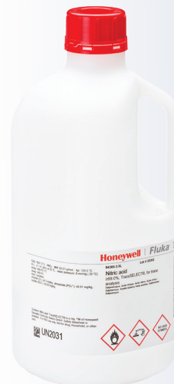
Honeywell Fluka - Nitric Acid TraceSELECT 84385-2.5L

The reduction of metals into mercury is more favourable than reduction to the solid-state electrode. Further on there is always a clean new Hg electrode surface available for each measurement.