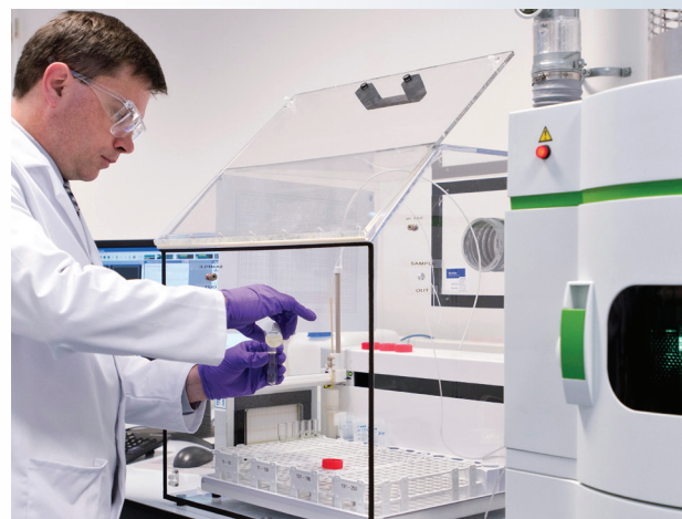
Atomic Emission Spectroscopy Analysis

With Honeywell's analytical reagents, superior quality and safety standards are a prime focus. We use a comprehensive Quality Assurance System in line with EN 29001 (ISO 9001) and each of our products is manufactured to clear, guaranteed specifications. We employ a large variety of modern analytical methods, such as inductively coupled plasma optical emission spectroscopy (ICP-OES), inductively coupled plasma mass spectrometry (ICP-MS), flame atomic absorption spectroscopy (AAS) and graphite furnace AAS (GF-AAS). This allows for specifically tailored control and analysis procedures for each product.