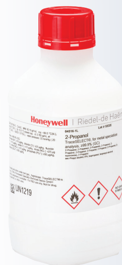
Honeywell Riedel de Haën - 2-Propanol TraceSELECT 04516-1L

The elemental response is usually independent of species, so it is often possible to quantify a species even when its structure is unknown (assuming good HPLC recovery). Identification, however, is based solely on retention time matching. Therefore, a compound in the sample can be identified only by comparison with a standard.