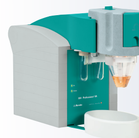
Multi-mode Electrode (MME)