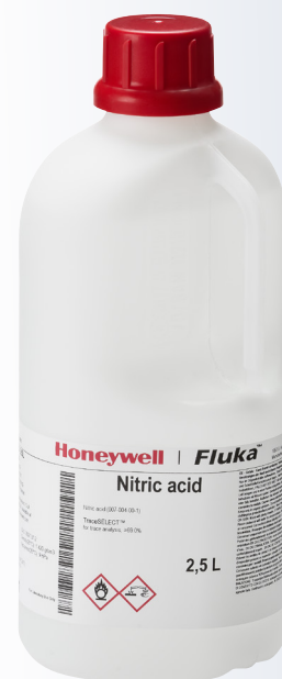
Honeywell Fluka - Nitric Acid TraceSELECT 84385-2.5L

The Honeywell Quality Management System guarantees consistent quality and safety for all TraceSELECT Ultra and TraceSELECT products. The reagents are produced and bottled under clean-room conditions.